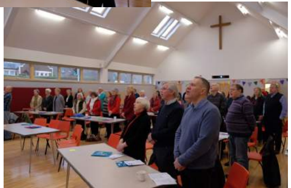
First Easy Worship Service in the large hall