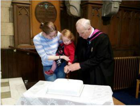
Dedication Service of Halls cutting of cake