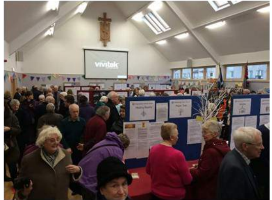
The Open Day