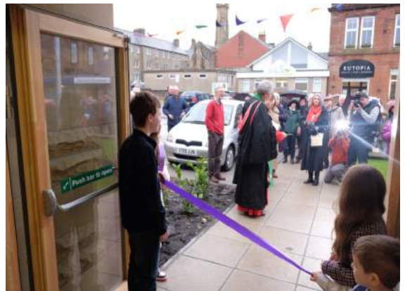
The opening of our new halls