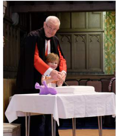
Our first service as Helensburgh Parish Church