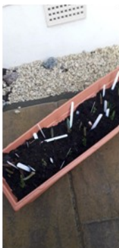
Sponsored bulb planting in the Autumn

Of course, we continue all our normal activities and badge work.