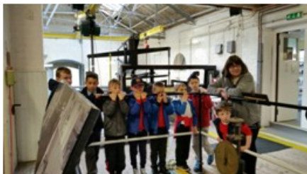
Visit to the Denny Tank